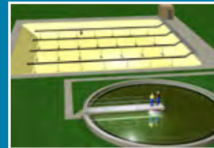
External Clarifier – Lagoon

BOD, extended aeration and ammonia removal with no algae concern.