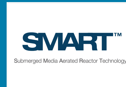
Effluent Nitrification Filter

Flexible, small-footprint design delivers high-quality effluent.