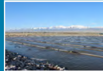
Partial Mix – Lagoon

The simplest Lagoon Solution: BOD removal and sludge management