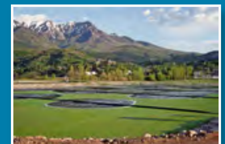
PAL™ DO Control

Submerged Media Aerated Reactor Technology