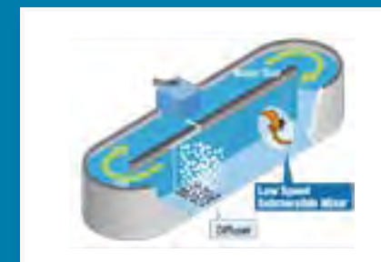
Oxidation Ditch BioReactor

Selected to deliver maximum performance and reliability at minimal ownership cost.