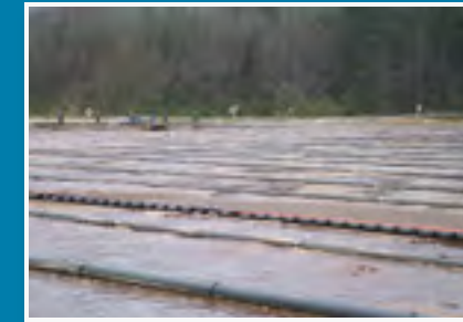
Complete Mix – Lagoon

The simplest Lagoon Solution: BOD removal and sludge management