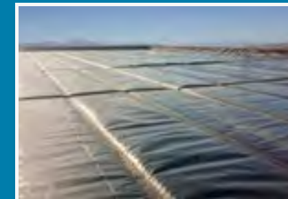
BioInsulate™ / BioShade™

Proven, reliable technology to manage sludge, BOD, TSS, and ammonia.